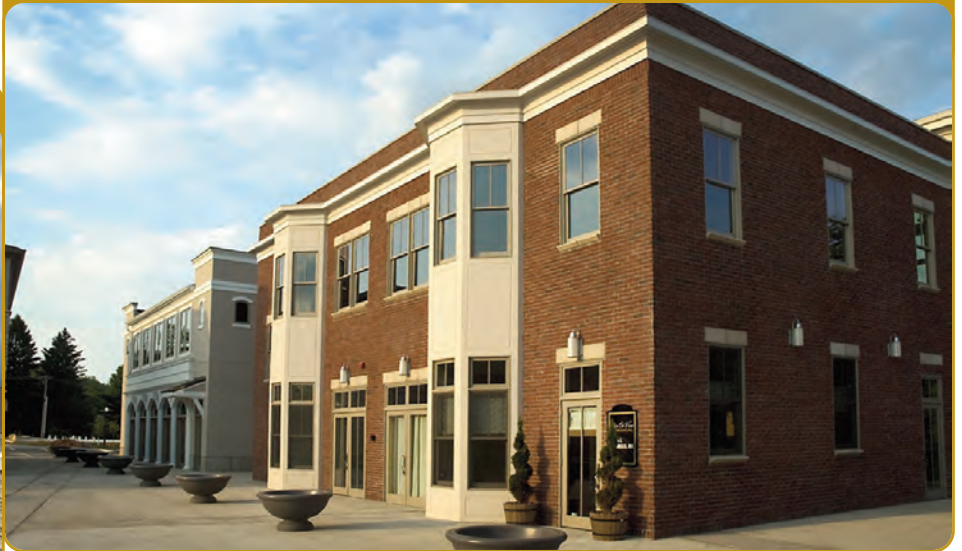
BUILDINGS C-6, C-7 | RENWICK VILLAGE CENTER