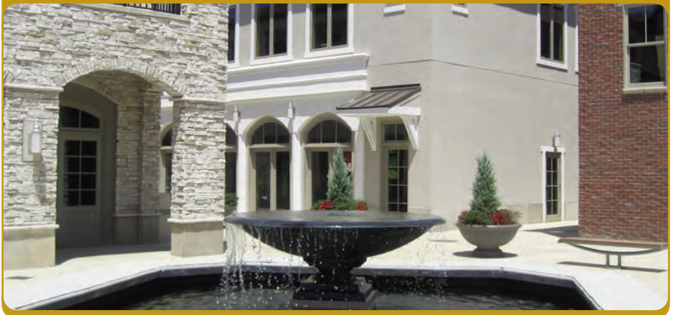
FOUNTAIN | RENWICK VILLAGE CENTER