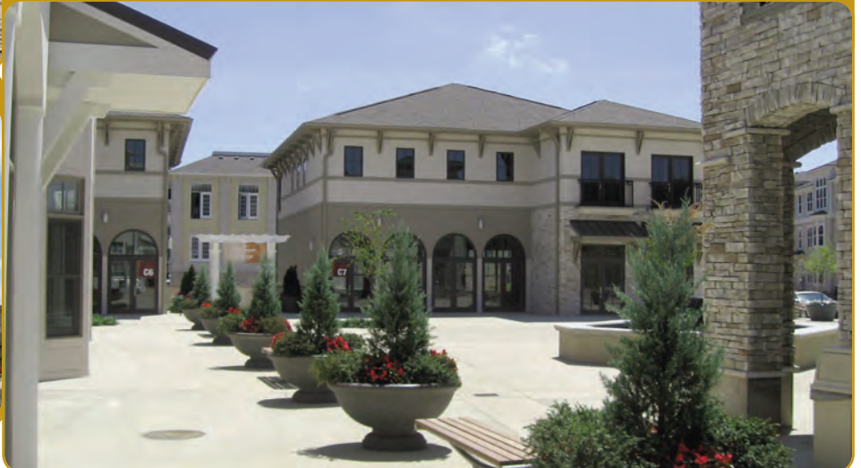
FOUNTAIN | RENWICK VILLAGE CENTER